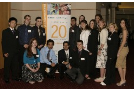
2004 Top 20 Under 20™ Award Recipients

Now accepting applications for 2005! Nominate a young leader in your community today!